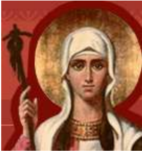
Saint Nino of Cappadocia, baptizer of the Georgians.

84% of the population in Georgia practices Orthodox Christianity. According to Orthodox tradition, Christianity was first preached in Georgia by the Apostles Simon and Andrew in the 1st century. It became the state religion in 319. The conversion to Christianity is credited to a woman, St. Nino of Cappadocia. The Georgian Orthodox Church, originally part of the Church of Antioch, gained its autocephaly and developed its doctrinal specificity progressively between the V and X centuries. The Bible was also translated into Georgian in the V century, as the Georgian alphabet was developed for that purpose. As was true elsewhere, the Christian church in Georgia was crucial to the development of a written language, and most of the earliest written works were religious texts. Georgian Orthodox Christian Active Churches are almost in 35 counties beyond Georgia.