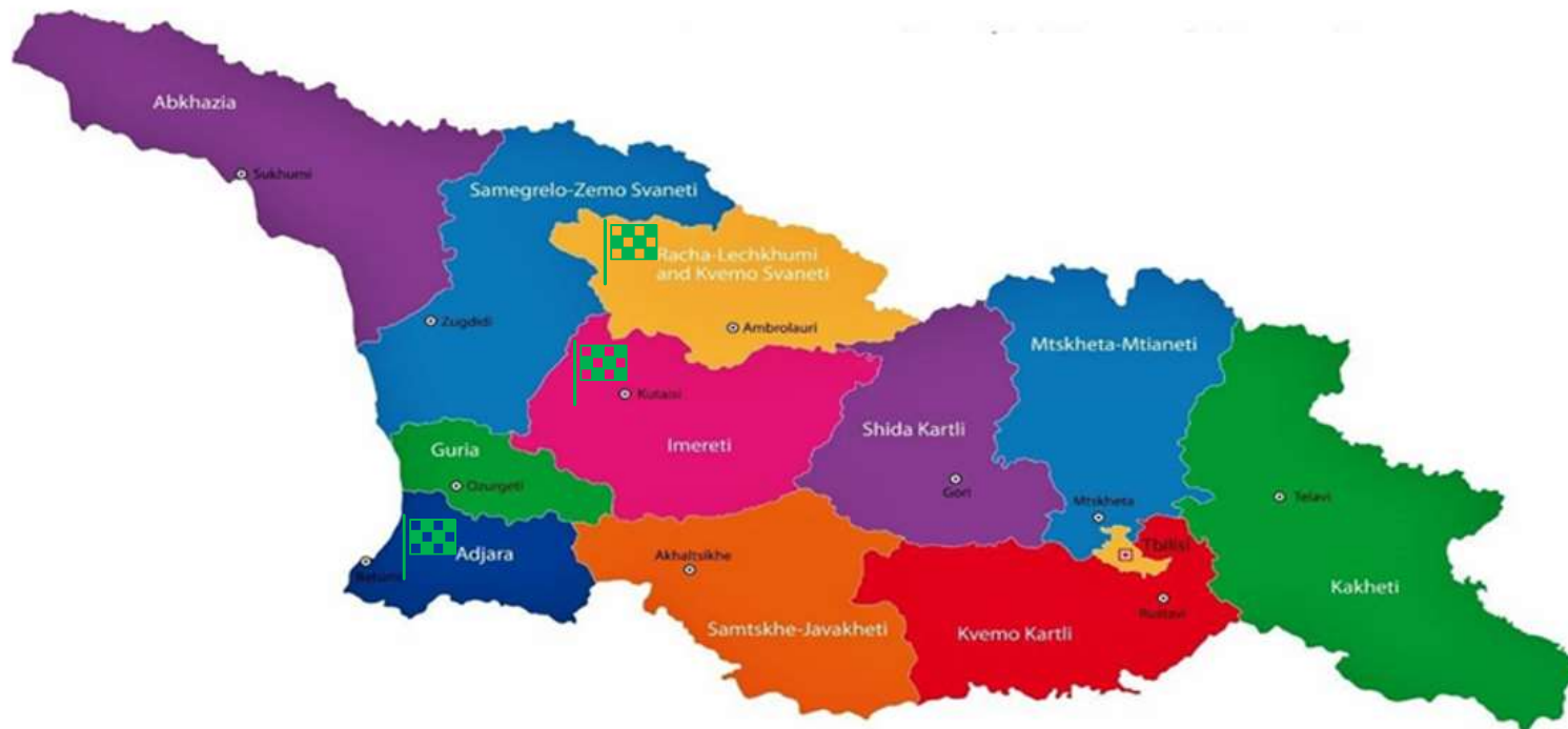
Administrative Divisions of Georgia

The country covers an area of 69,700 square kilometers (26,900 sq mi), and has a population of 3.7 million people. Tbilisi is its capital and largest city, home to roughly a third of the Georgian population.