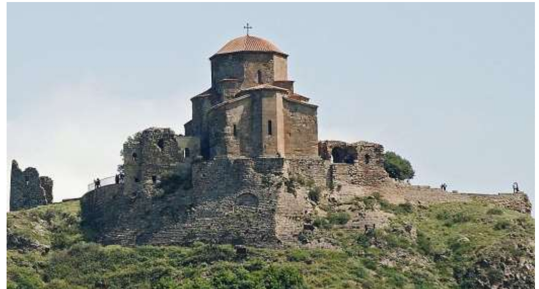
Jvari Monastery, near Mtskheta, one of Georgia's oldest surviving monasteries (VI century)