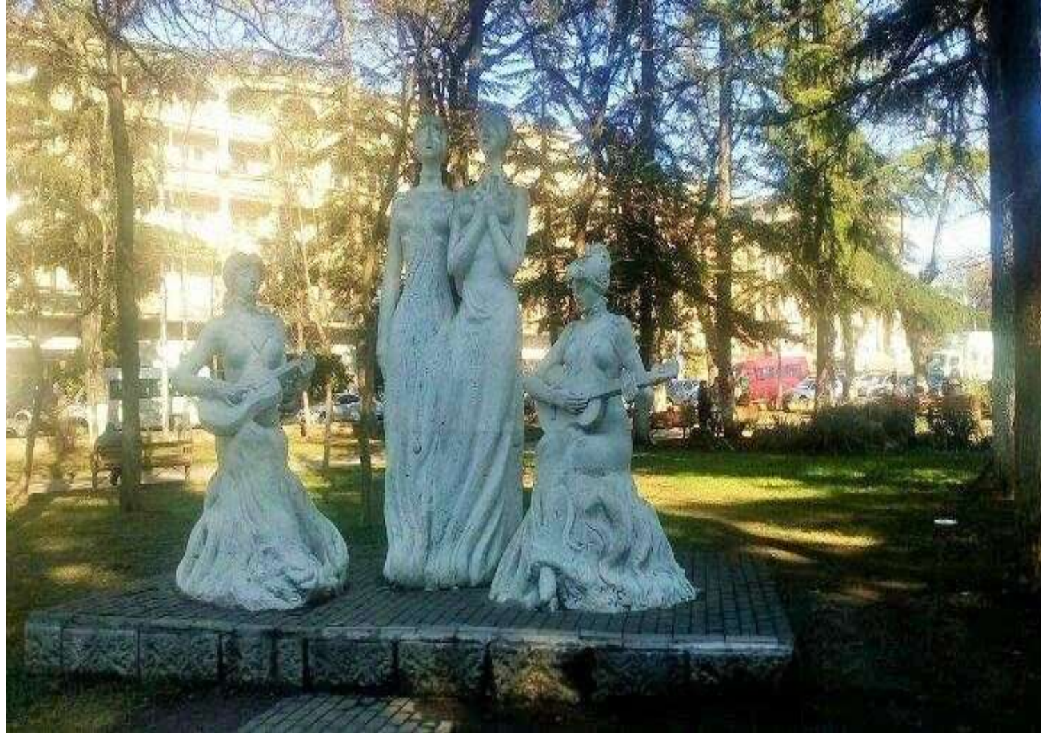
Monument of imeretian singers “Ishkhnelebi”

Breakfast depends on flight time Move to Airport. Farewell.