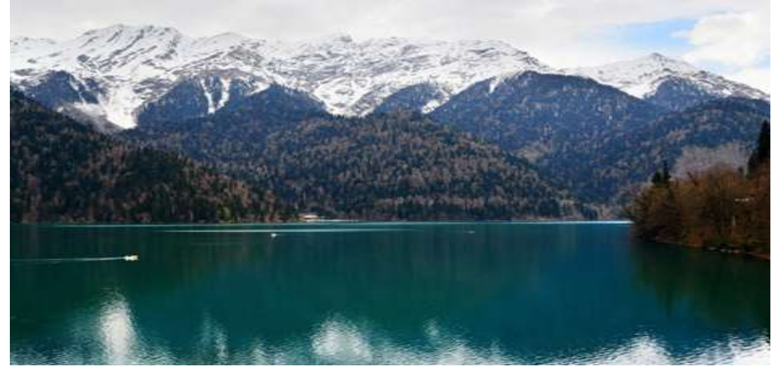
APHKHAZETI, LAKE RITSA