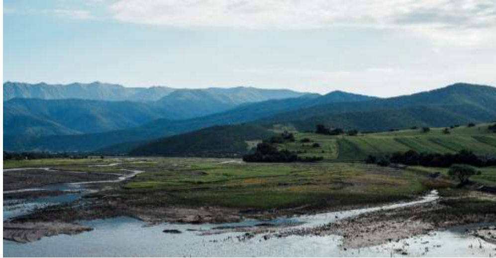
KAKHETIAN HIGHLAND / PANKISI