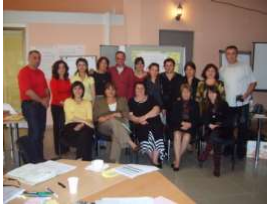
Group of participants