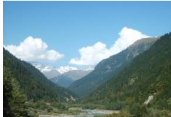
Riv. Rioni with Mamisoni Pass view