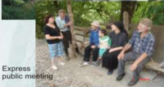
Express public meeting

Holidays and weekends with local families in UTSERA the best place for rural tourism devotes.