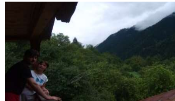
Honey moon enjoyable place