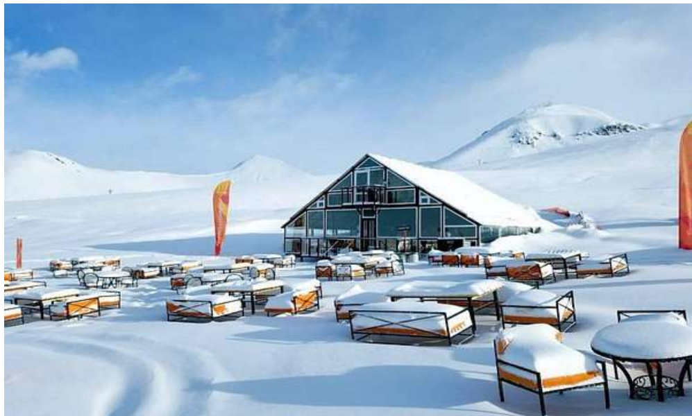
MSKHETA-MTIANETI, GUDAURI SKY RESORT