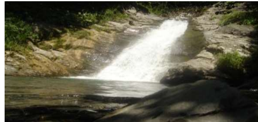
Riv. Beghlori waterfall