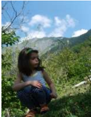
Favorite place for kids

Hospitable hosts stand variety of Racha cuisine“: from home-made bread and cheese to wild fowl