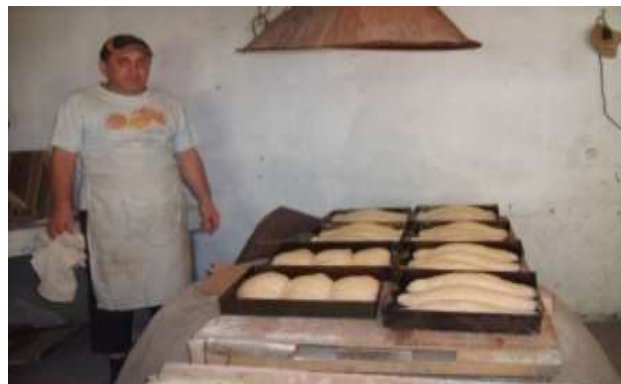
Delicious "Rachian bread"