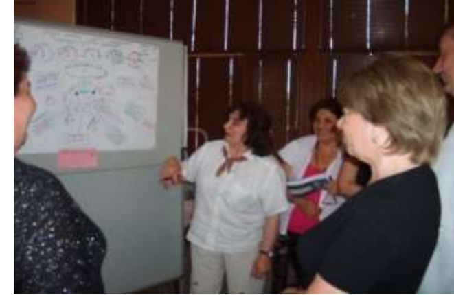
ICCT proposal presentation