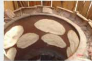
Hot bread in tone