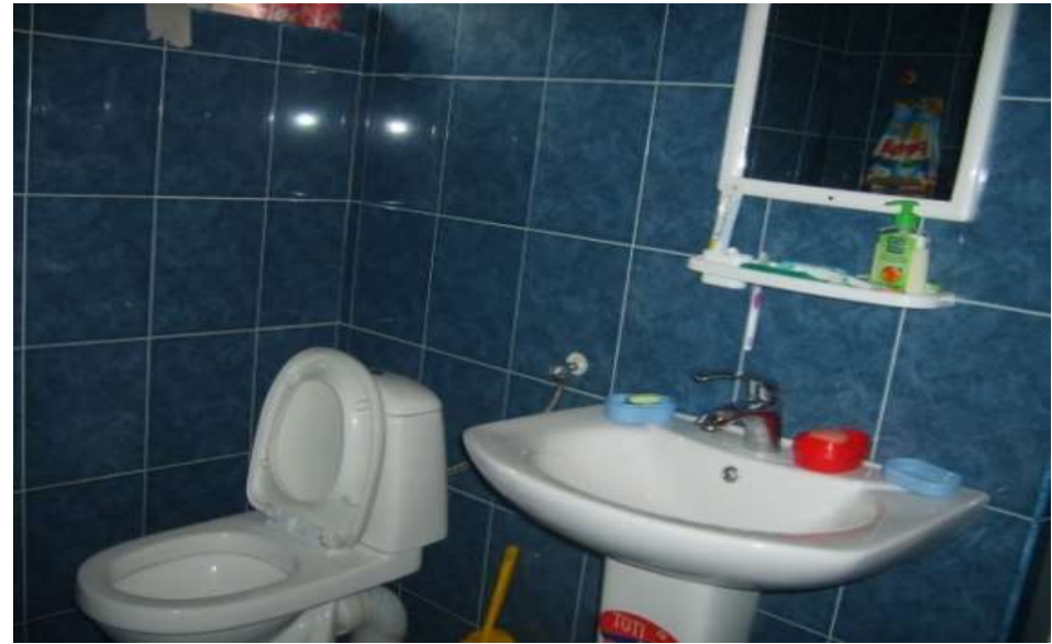
Hostess: Mrs. Nona Maisuradze Double rooms: 6